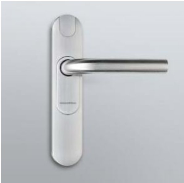
Figure 2 – Smart Handle 3062

LSM-Starter 3.3 will be made available in a separate product information.