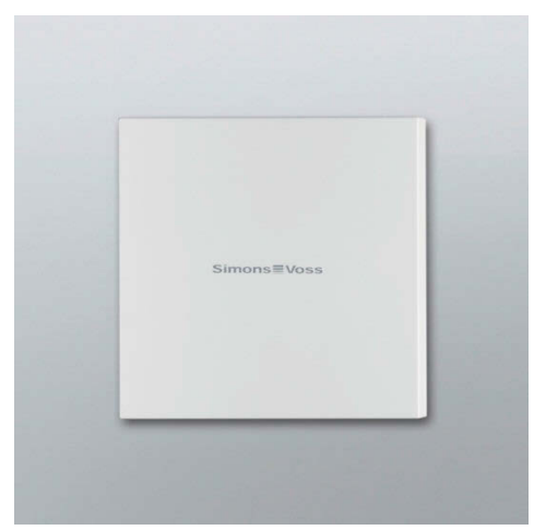
External reader unit