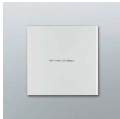
External reader unit