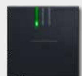
SmartRelay 3 Advanced LED Reader