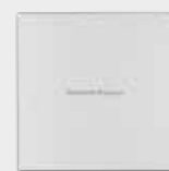
SmartRelay 2 Reader