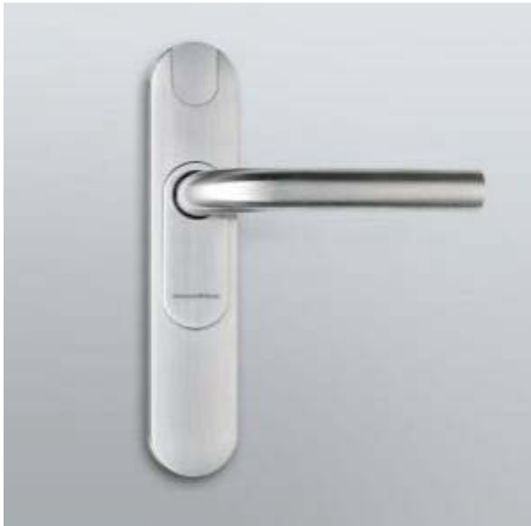
Figure 2 – Smart Handle 3062

LSM-Starter 3.3 will be made available in a separate product information.