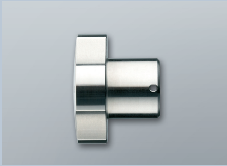
Knob for heavy duty doors (Z4.KNAUF2)