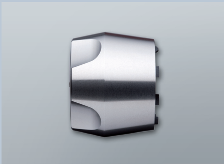
Knob for heavy duty doors (Z4.KNAUF7)