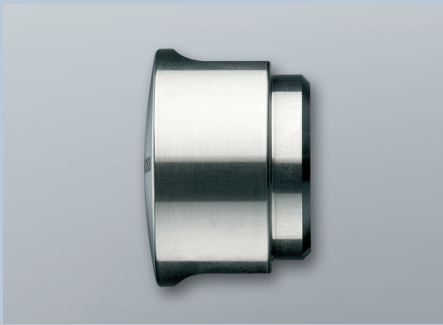
Shorter outer knob (Z4.KNAUF4)